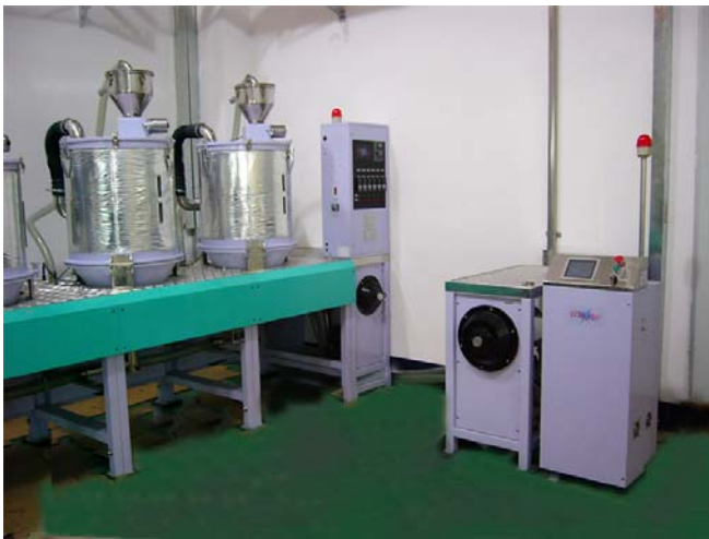
Factory B The Control Room