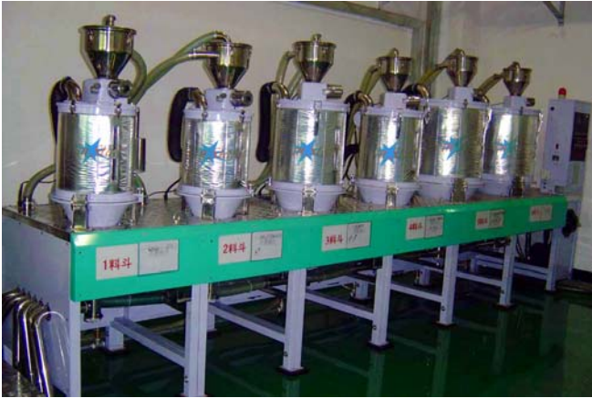
Factory A The Control Room