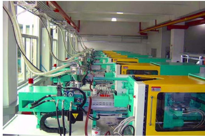
Factory A The conveyance ducts of the system