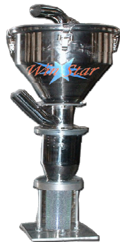
Premium model specialized in effective powder removal.